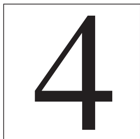
Fig. 1. Example of a small image where the caption is placed next to the image.

Smaller objects can be placed arbitrarily (Fig. 1). Use the SCfigure or SCTable environments from the sidecap package. The text is aligned next to the objects. Please use this for images with a width smaller than 0.7*\text{textwidth} .